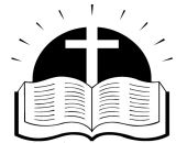
Kindergarten Bible Sunday

On this special morning our Kindergarteners will receive their "First Bible Story Book". This beautifully illustrated picture book shares 13 special stories from both the Old and New Testaments. Please have your child at church by 9:40AM that morning so we can gather together and enter the church as a group. If you did not receive a postcard about your child's storybook, please contact Carrie O'Brien as soon as possible.